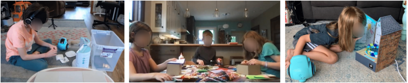
Figure 2: Exploration, Design, and Evaluation of the Unboxing Experience — Our exploration and design of children’s unboxing experiences involved observations of children’s unboxing of a social robot (left) and co-design sessions to design new unboxing experiences (middle). Drawing on the ideas developed in the co-design sessions, we developed a curated unboxing experience that involved a “social” box and assessed how our design shaped children’s unboxing experiences of a social robot (right).

humans and robots while improving users’ perceptions of anthropomorphism and likability [36, 52]. Often heavily influenced by appearance and initial interactions, first impressions impact user engagement, expectations, perceptions, and behavior [20, 31, 38]. These first impressions have been shown to impact the development of initial and long-term relationships [23, 42], trust [46], and user experience [37]. Research has also shown that initial bias or mental images formed during this time seldom recover [36].