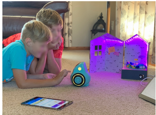
Figure 1: Children Interacting with Our Designed Unboxing Experience for a Social Robot – In this paper, we draw on the emerging phenomenon of “unboxing” consumer products to improve initial interactions between children and social robots. We explore the design space of unboxing social robots with children as co-designers, develop a curated unboxing experience, and evaluate our design. Our work explores and characterizes a new design space for improving user experience with social robots.

© 2022 Association for Computing Machinery. ACM ISBN 978-1-4503-9157-3/22/04...$15.00 https://doi.org/10.1145/3491102.3501955