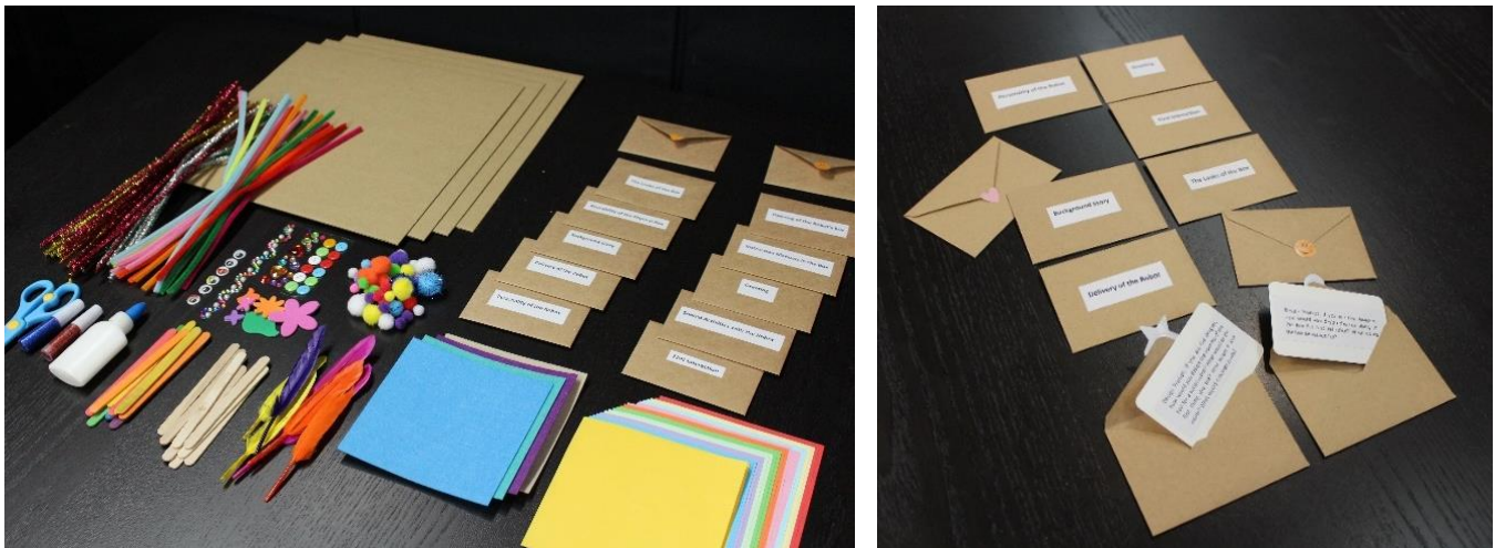
Figure 3: Resources Used in Co-design Sessions – As co-designers, children contributed to the design of a new unboxing experience by developing a narrative, designing a box that reflected the narrative, and envisioning initial interactions that children may have with their own social robot. Resources were provided for ideation (left) and fabrication (right).

Design Challenge 3: Role-play with Your Social Robot Figurine Now imagine you, the designer, and your coworkers are preparing for a presentation to potential investors or customers. Your goal is to describe or act out how the robot's first interaction with its user will