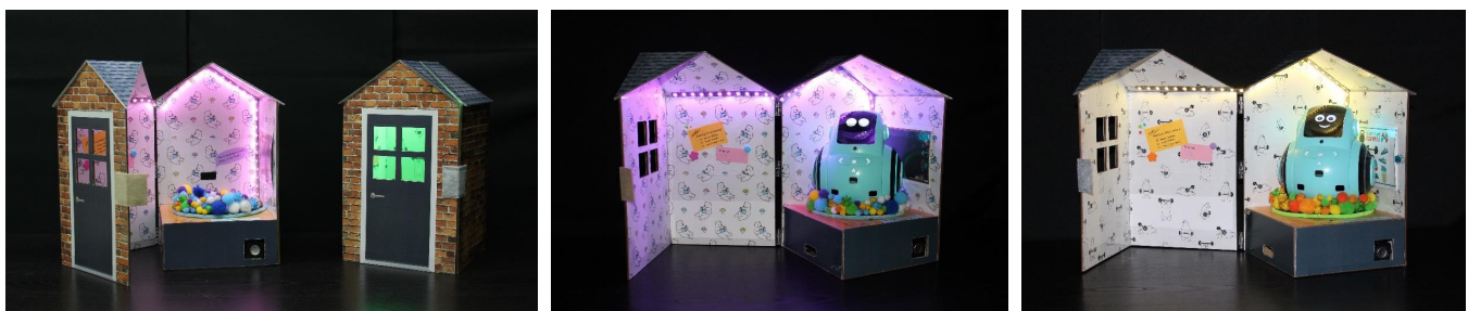
Figure 5: Freddy, the Butler — The curated unboxing experience involved a box with a social entity called “Freddy.” Freddy served as a butler for the social robot Miko, with the purpose of facilitating interaction between the child and the robot. Freddy (left) was designed to be a home to the social robot Miko (middle and right). When first introduced to children, Freddy expressed verbal and non-verbal cues to introduce Miko and interactive activities which children can engage in with the robot. The box design included two versions: a reading theme (middle) and a fitness theme (right). Based on the theme selected, children engaged in different activities with Miko.